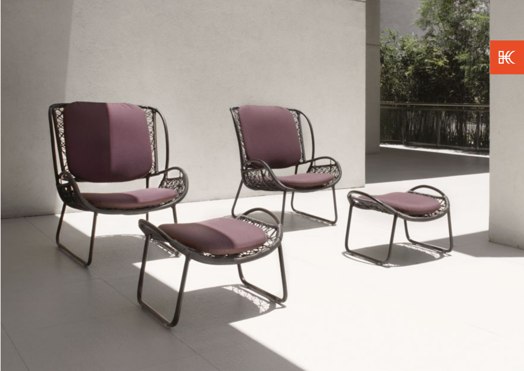
ADESSO design by Federica Capitani

Left page: Adesso easy armchairs with end tables and ottomans in brown and sky blue.